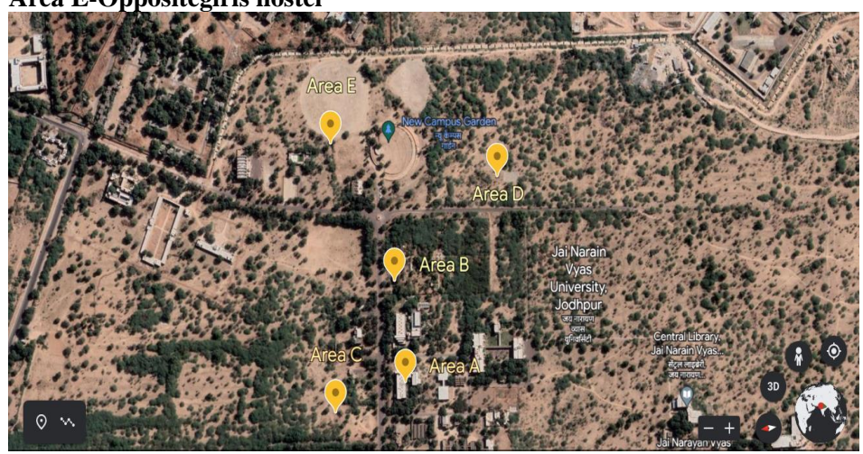
Fig. 1: Area covered.

*Area A-Zoology Department, Area B-Botanical Garden, Area C-Scout ground, Area D-Back side area, Area E-Oppositegirls hostel