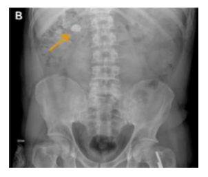
Figure 2. Simple renal and bladder radiography: The arrow shows radiopaque renal lithiasis.