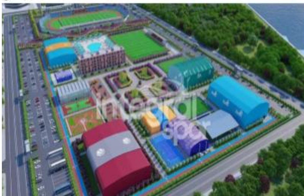
Fig. 2. Multifunctional sports complex.

At the same time, it should be noted completely new directions in the development of the urban development theme of the formation of multifunctional sports complexes. The first is related to the inclusion of a sports facility in the structure of polyfunctional public facilities (Fig. 2).