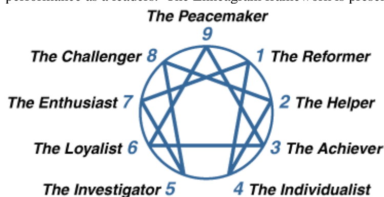
Figure-1: Enneagram Framework Dimensions.

Enneagram is considered as one of the powerful evaluation system helps to determine the personality on the basis of select dimensions. The Enneagram focuses on nine select types of Personality traits. Each of the traits have its own strength followed by weakness, focus to grow and opportunity to excel. The Enneagram framework reveals to compare the leadership style of the leaders who may be from corporate, politics, groups etc. The Enneagram framework focuses on evaluation of self actualization based on higher levels of performance as a leaders. The Enneagram framework is presented in the following figure.