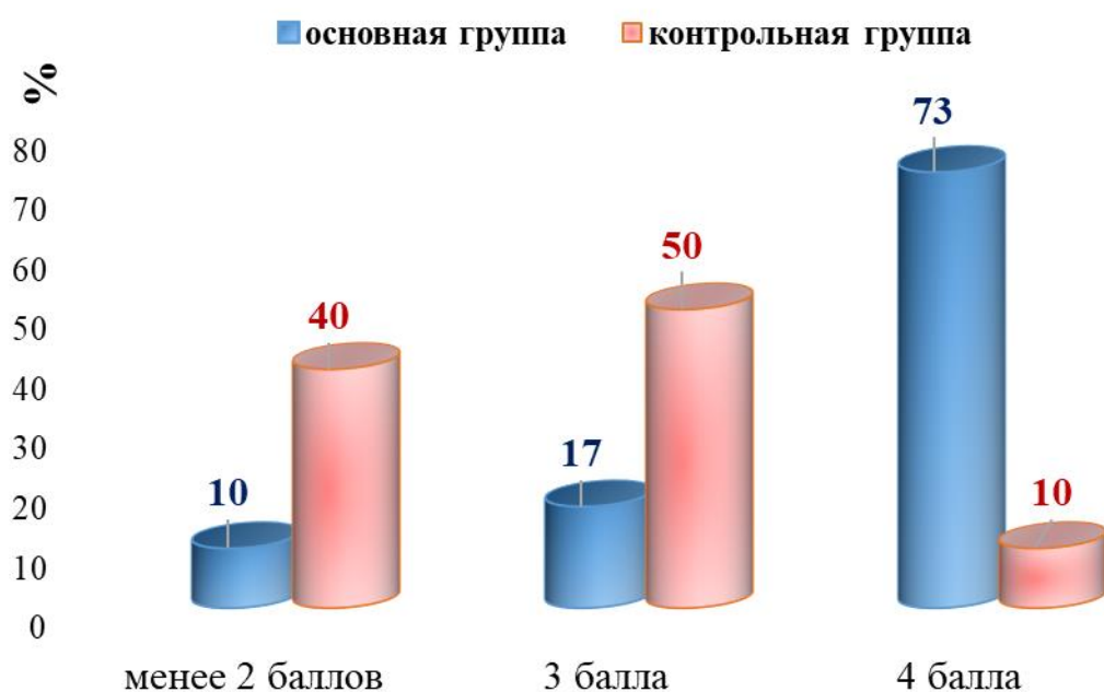
Figure 1. Results of adherence assessment using the Morisky-Green scale in patients after 3 months of therapy.

The number of adherents to therapy was 73% in the main group, while in the control group it was only 10%. Observations of the dynamics of hemoglobin growth in the study groups showed that in the main group there was a higher level of its monthly increase in the blood (Fig. 2). By the end of 3 months, in the main group the hemoglobin level averaged 121 g/l, while in the control group it was 111 g/l.