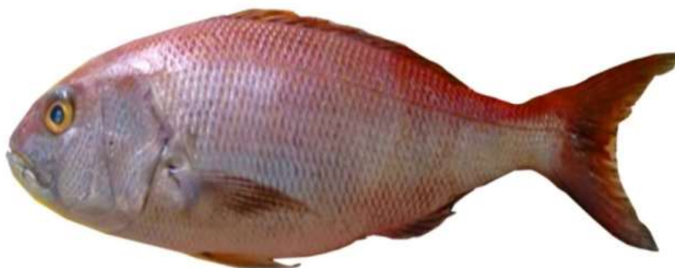
Fig.2. Etelis coruscans

Deepwater longtail red snapper (Allen, 1985)- Etelis coruscans (Valenciennes, 1862).