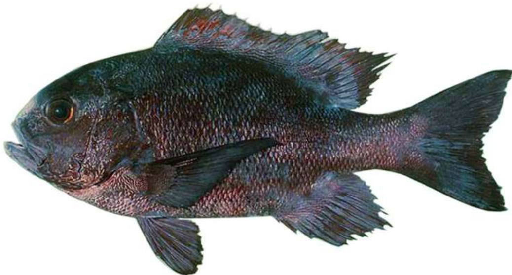
Fig. 4. Black and white snapper ( Macolor niger ).

Black and white snapper (Allen, 1985), Macolor niger (Forsskål, 1775).