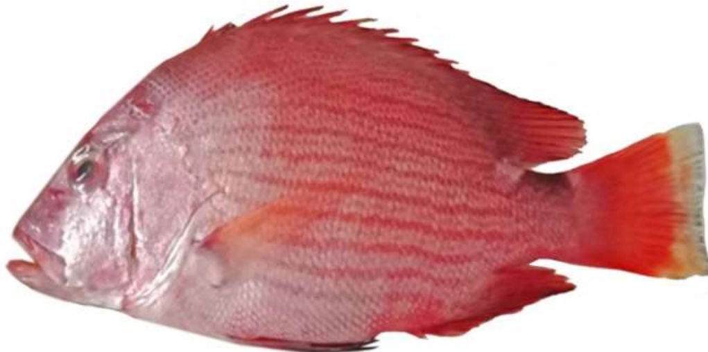
Fig. 3. Lutjanustimoriensis

Timor snapper (Allen, 1985)- Lutjanus timoriensis (Quoy&Gaimard, 1824).