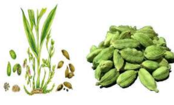
Fig 2 (a): True Cardamom Fig 2(b): Cardamom Pods (elaichi)

Scientific name: Elettaria cardamomum Common name: small cardamom, green cardamom, or true cardamom, Ailum, Elachi.