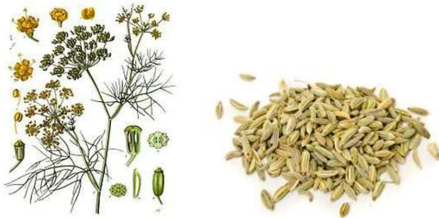
Fig 1 (a): Foeniculum Vulgare (Fennel)