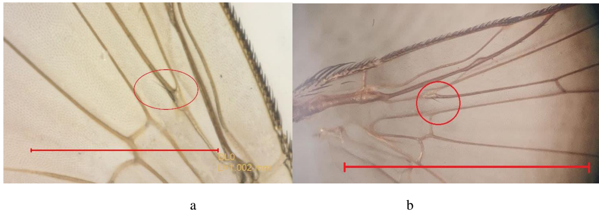
Plate (2): L. obsignata ; (a) Male, Wing dorsal view; (b) Wing ventral view