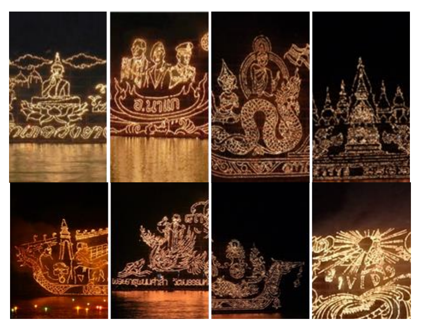
Figure 3: Shapes of Nakhon Phanom's illuminated boat

On the Mekong River, which has a turbulent current at the end of Buddhist Lent, a large illuminated boat with a length of approximately 50–80 meters and a height of approximately 30–50 meters must be constructed using a combination of materials that are durable, strong, meticulous, and safe. The following nine components comprise a boat with illumination: 1) Bamboo trunks, 2) steel, 3) a 200-liter plastic tank, 4) steel wire, 5) rope or old motorcycle tire sections, 6) 100-ml coffee cans, 7) yarn, 8) diesel fuel, and 9) other items. Bamboo is the primary material because it is a typical environmental component. Sanur Lapha (2020: interview) reported that the provincial officer requested the use of bamboo as the primary material for the illuminated canoe, with the addition of industrial materials for safety and ease of construction.