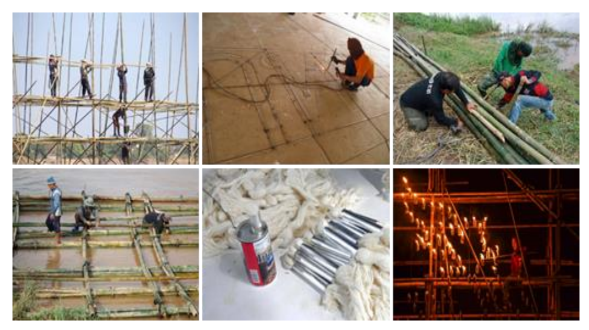
Figure 5: A technique for building the illuminated boat