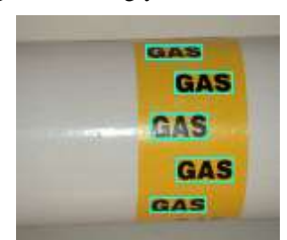
Fig 5: Sample text detection from ICDAR 2013 scene images