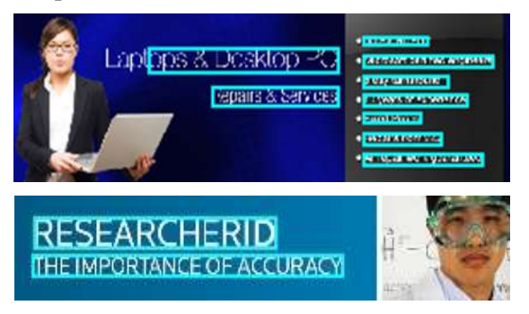
Fig 6: Sample text detection from ICDAR 2013 born-digital images