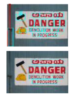
Fig 1: Image filtering, (a) character level connected components, (b) post filtering, (c) word level, (d) line level