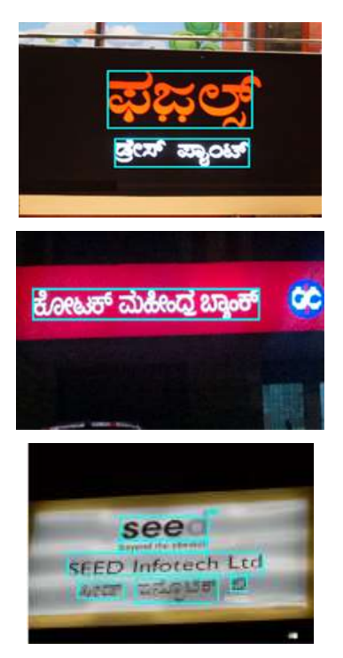
Fig 4: Sample text detection from kannada images dataset

2)MSRA-TD dataset: The MSRA-TD500 dataset is made up of images with multi-oriented text in English and Chinese that were taken using a pocket camera. The proposed model outperforms in recall (90%) and F1-score (85%) whereas Zhou et al. [26] does better on precision (87% vs. 83% of the proposed model).