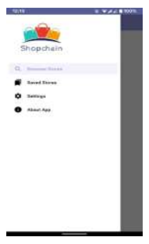
Fig. 4: Navigation Drawer Layout.

All shop-related details are fetched from the Firebase Database which are collected from the shop owner at the time of registration. Customers can easily access this information in the "Discover stores" menu in the navigation drawer (Fig. 4).