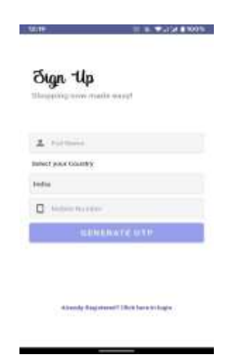
Fig. 2: UI for registration, user sign-up registration

During store registration (Fig. 3), we have used Google Maps API to get accurate latitude and longitude of the location of the store. This will help in suggesting nearby shops to customers. This will be executed by getting the latitude and longitude of the customer's current location and using Google Maps Direction API. Google Maps Direction API will help to calculate the distance between the customer and the shops.