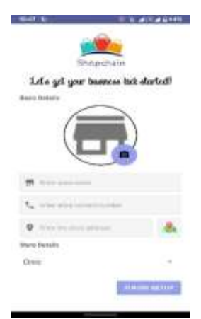
Fig. 3: UI for registration, shop registration

During store registration (Fig. 3), we have used Google Maps API to get accurate latitude and longitude of the location of the store. This will help in suggesting nearby shops to customers. This will be executed by getting the latitude and longitude of the customer's current location and using Google Maps Direction API. Google Maps Direction API will help to calculate the distance between the customer and the shops.