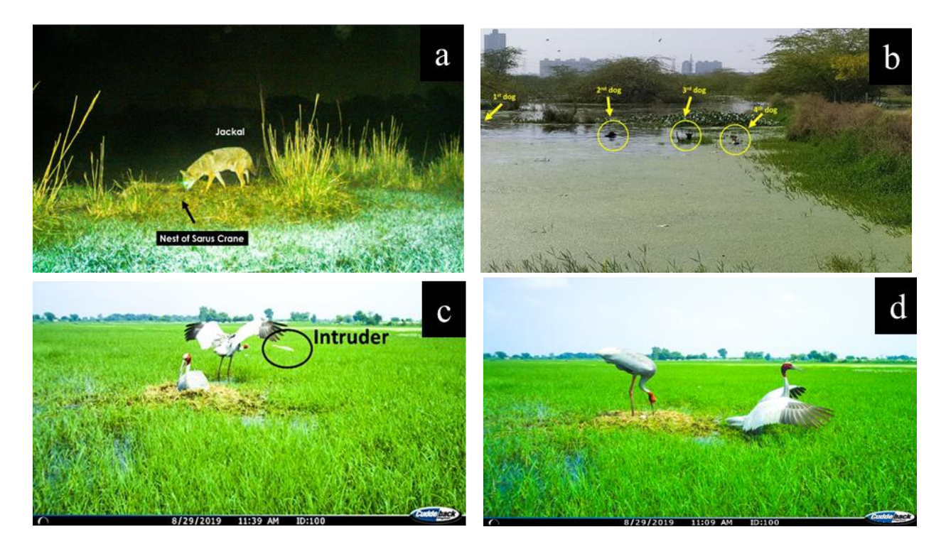
Image 3. Threats to Sarus Crane were recorded using cuddy back camera traps (a) Jackal searching eggs on the nest of Sarus Crane in Sultanpur National Park; (b) Feral dogs searching the eggs in the Basai wetland; (c) Intruder coming inside their territory; (d) Male protecting his nest from a predator.