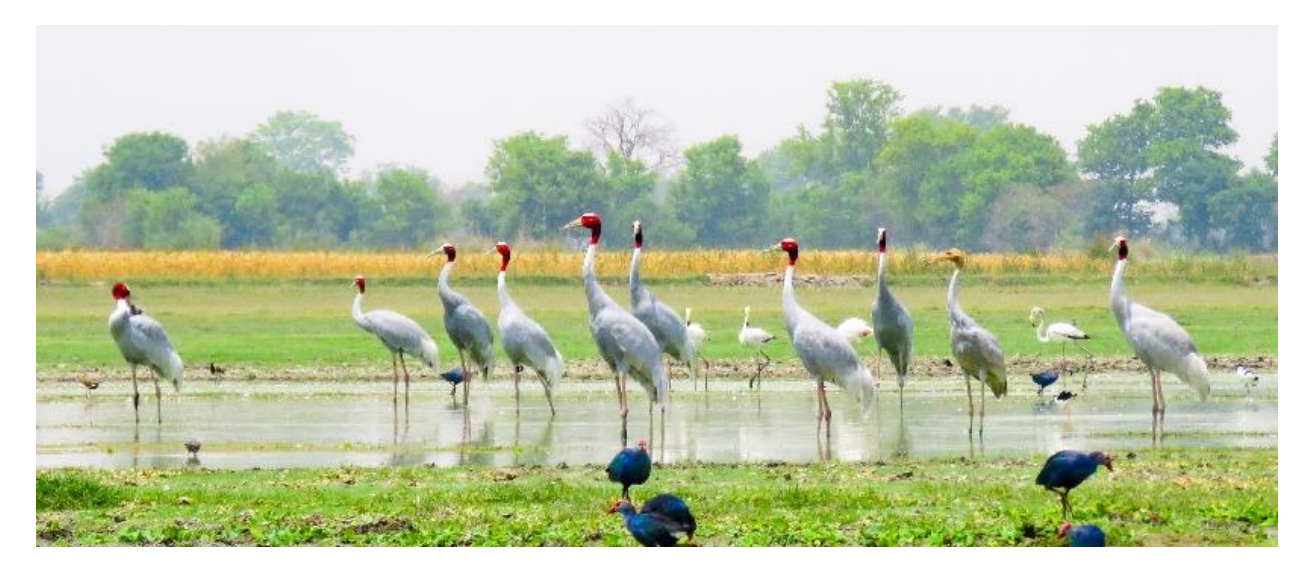
Image 2. A flock of the Sarus Crane in the marshland of the study area.