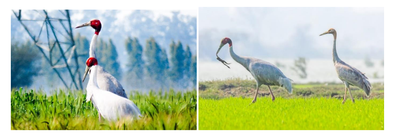
Image 1. Pairs of Sarus Crane in agricultural land.