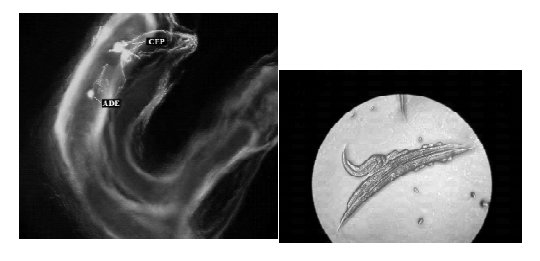
(a) (b) Figure: 1 (a) Adult N2 worm (b) Adult Transgenic BY250 worm.