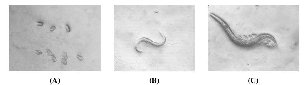
Figure 2: (A) Eggs of hypochlorite solution treatment worm just after bleaching process (B) Transgenic worm larval stage at 24 hr. in the same laboratory conditions (C) The adult worms obtained after 24 hr. of incubation period.